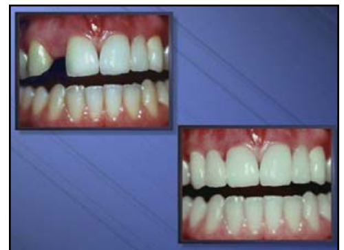
A beautiful new smile!