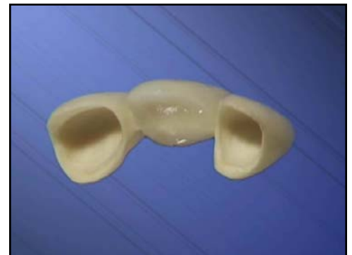
An all-porcelain bridge